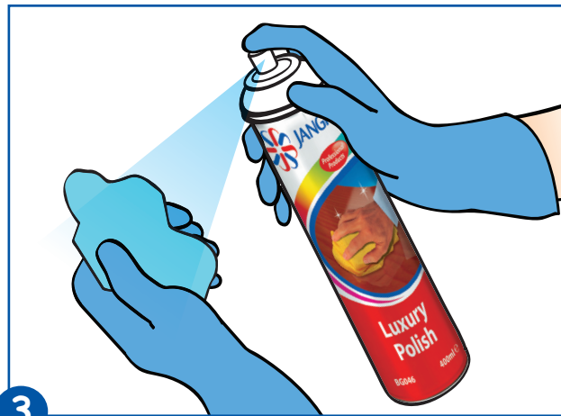
3 Spray onto cloth and wipe.