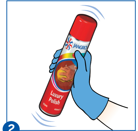
2 Shake can well before use.