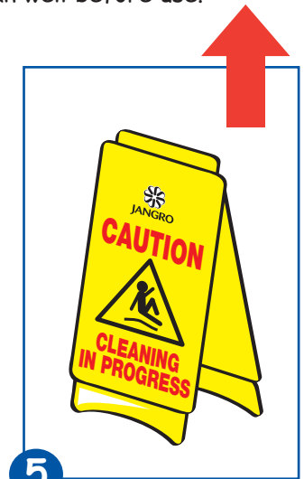
5 Remove safety signs.

Health & Safety Please refer to relevant COSHH Sheet.