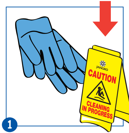
1 Put on PPE and place safety signs.